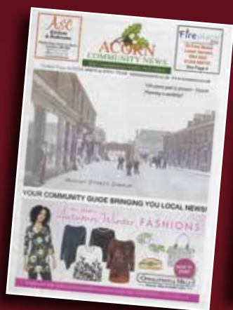
Market Street, Church