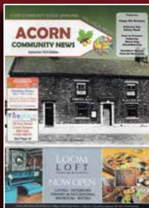
Black Dog Inn