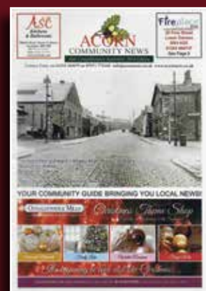
Whalley Road, Clayton-le-Moors