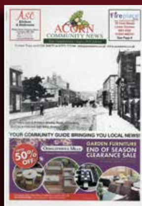
Whalley Road, Accrington